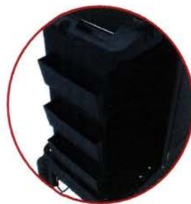
3-SIDED HANGING BAG WITH SHELVES