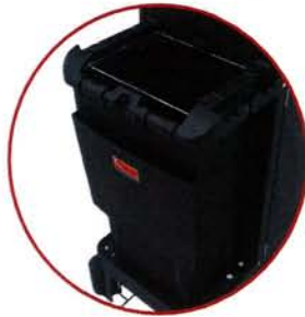
AMENITY COLLECTION BAG