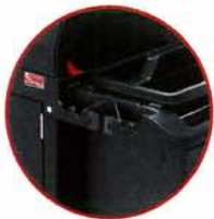
LONG-HANDLE TOOL STORAGE