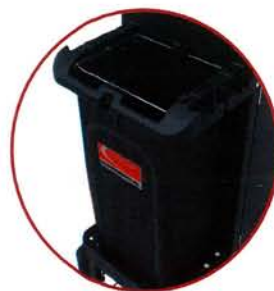
STANDARD HANGING BAG