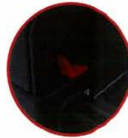
ADJUSTABLE CASTER SYSTEM

Innovative caster system allows for a fixed front caster mode, which keeps the housekeeping cart straight when desired, or full-range 360° movement, perfect for tight spaces, sharp corners, turn-arounds, and side-to-side handling.