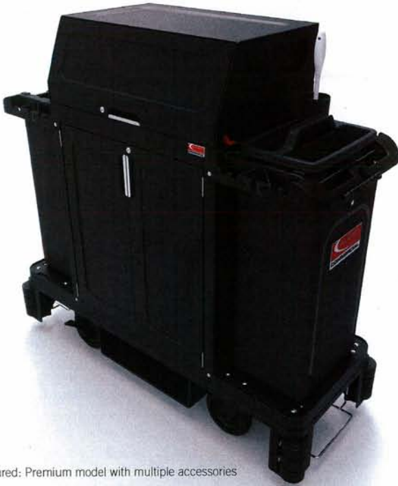
Featured: Premium model with multiple accessories